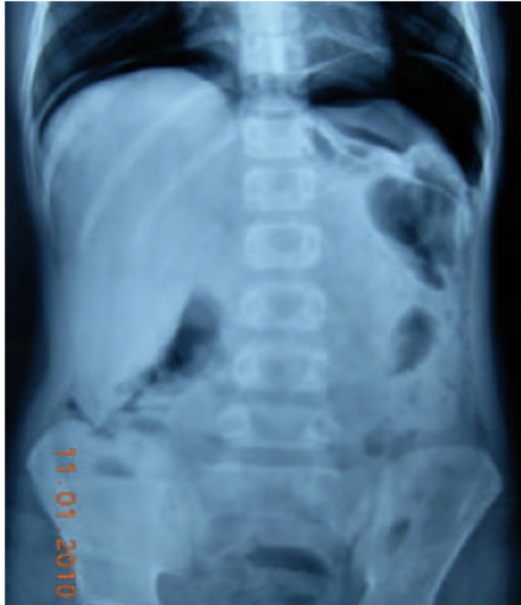
Fig. 1: X-ray abdomen shows Gas under Diaphragm