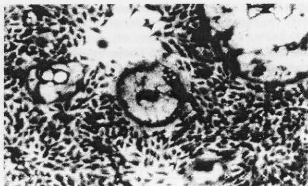
Fig. 2: Giant cell formation in vero cell monolayer following 30-36 hr of infection by reovirus

F showed 30%. These observed data were sufficient to calculate TCID 50 titer of P3 adapted reovirus sample by using Karber method (Karber, 1931) and it was found that the infectivity titer of P3 adapted reovirus sample was 10 -5.5 TCID 50 .