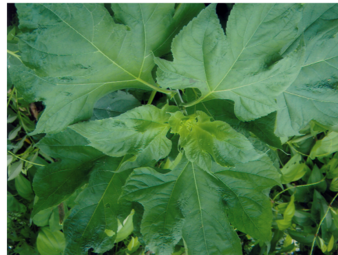
Plate 1: Tithonia diversifolia plant

Effects of crude extract of T. diversifolia on serum biochemistry of rats: The aqueous crude extract of T. diversifolia caused a statistically significant (p<0.05) increase in the levels of serum Total Proteins (TP) and Albumin (ALB) at the dosage of 400 mg kg -1 b.w.