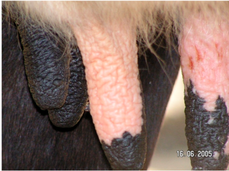
Fig. 2: The lesion on the thicker udders