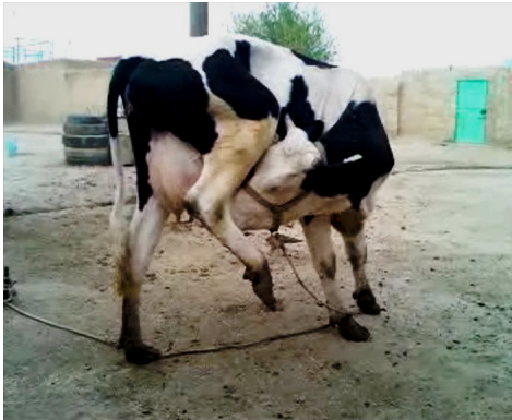
Fig. 1: Self-Sucking a dairy cow

different care and feeding conditions at the age of 5 to 7, 5, determined to have self-sucking complaint were used for the study.