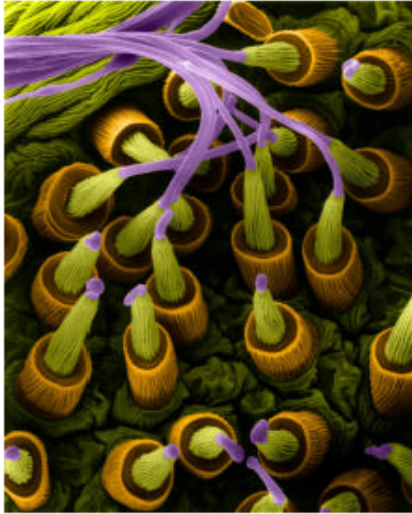
Fig. 1: The cribellum plate of a spider consists of thousands of minuscule spigots reproduced with the permission of Dennis Kunkel Microscopy, Inc