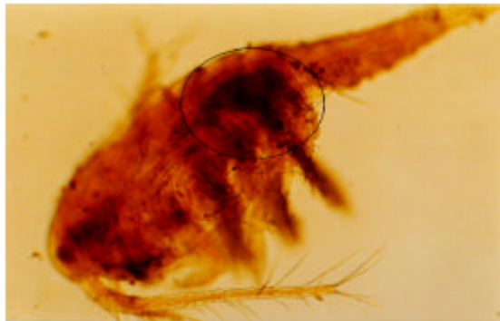
Fig. 3: Infected Cyclops , circle show procercoid in body cavity