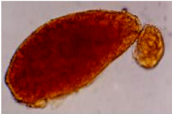
Fig. 2: Procercoid stage of ligula intestinalis (separated from Cyclops )