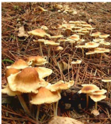
Fig. 2: The poisonous mushroom ( Inocybe fastigiata ) causing clinical sings in this dog

found small urinary stones in the urinary bladder and mildly mineralized right kidney. The electrocardiogram revealed Sinoatrial (SA) exit blocks and sinus arrest with 80-90 beats of ventricular rate (Fig. 1a). Our university biologist identified the ingested mushrooms as Inocybe fastigiata , based on the photo taken by the owner (Fig. 2).