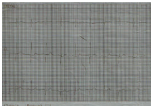
Fig. 3: Sinus bradycardia in the 24th h after OJA