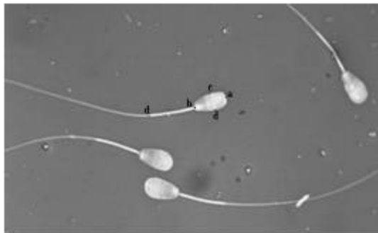
Fig 1: The vision of sperm cells were clear and sharp. The borders of mitochondria and heads were easily seen. The border of the middle piece and principal piece was clearly seen due to the termination of the thick mitochondrial helix (d). The distances between a-b were accepted as head Length (L); c-d accepted as head Width (W) and b-d were accepted as Mitochondrial Length (ML). According to these measures, ellipticity (L/W) and elongations [(L-W)/(L + W)] were calculated

On each slide, around 50 sperm cells were measured according to their head length, head width and the mitochondrial length of by using Manufacturers software (Leica IM50, version 4, copyright 1992-2004) have been installed on the computer connected to the camera. The scale was 5 µm and already calibrated by Leica.