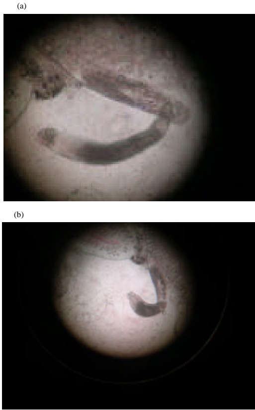
Fig. 1: Tetraonchus sp. (Orjinal)

is representative of almost the entire population. Accordingly, Tetraonchus sp. which is a Monogenean parasite was isolated from Tilapia zilli and Acanthobrama marmid and Diplozoon paradoxum was isolated only from Tilapia samples.