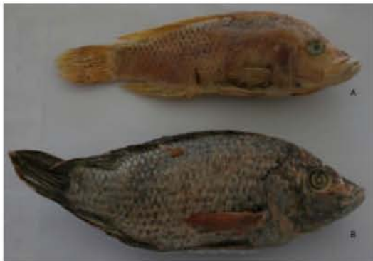
Fig. 1: Two Oreochromis niloticus specimens caught on 9 August 2009 (A: 18,0 cm TL) and 12 September 2009 (B: 20, 6 cm TL)

On 9 August 2009 and 12 September 2009 (Fig. 1), two Oreochromis niloticus individuals were captured from entrance of the Damsa Dam Lake by gill net with 55 mm mesh size and stored in deepfreeze and transformed to laboratory in 96% ethanol (38°32'54,21"N-34°55'24,66"E, altitude 1223 m). Sampling locality are shown in Fig. 2. The specimens were weighed and morphometric and meristic