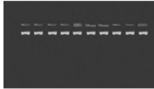
Fig. 1: DNA extracted samples