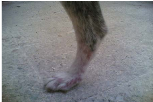
Fig. 2: Self-induced alopecia and erythematous pruritic lesions of the flexural site and interdigital area of the hindleg

The most common signs the dogs exhibited were exemateous lesions (41%), pododermatitis (35%) and lick dermatitis (32%). Yet, we had no occasion to explain any primary lesion. Inguinal, periorbital areas, dorsal, lumbar regions, ears and ear pinnae as well as flexural sides were also involved. About 15% of allergic dogs exhibited lesions of the face, neck and head while 23% represented with periorbital lesions and 15% with hyperpigmentation. The percentage of otitis externa we observed (13%) seemed to be contradictory to the data explaining higher ratios (Paterson, 1995; Leib and Monroe, 1997; DeBoer and Hillier, 2001a; Hillier and Griffin, 2001b; Zur et al. , 2002).