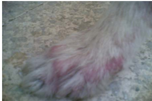
Fig. 3: Pruritic moist dermatitis between dorsal interdigital area

The reason was established to be related to ocular and ear symptoms which may be also due to an allergic disease are at 1st examined by surgery department which makes the percentages smaller than they really are. Food allergy associates atopy in dogs with a percentage of 7%. Dogs with food allergy complaint, develop both dermatologic and gastrointestinal symptoms (Harvey, 1993; Olson et al. , 2000; Hill and Olivry, 2001; Jeffers et al. , 2001; Chesney, 2002).