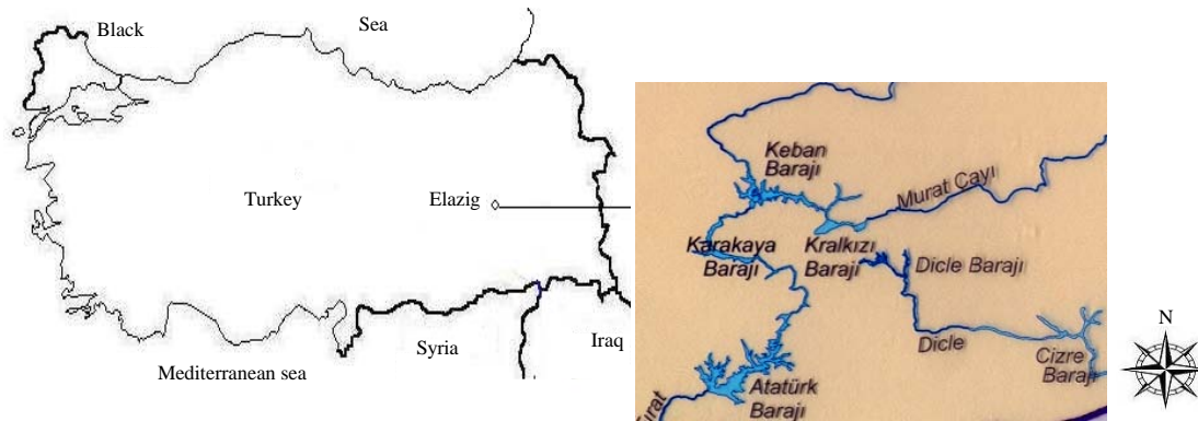
Fig. 1: The map of Kalecik Dam lake

in the species identification and counts of diatoms whose continuous preparations have been made. In addition, the species identification was checked at AlgaeBase data base ( www.algaebase.org ) (Guiry and Guiry, 2009). The counts in continuous preparations were based on relative density and the results were expressed as organism (%) (Sladeckova, 1962).