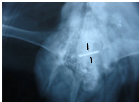
Fig. 1: The abdominal position of the FB in the case seen on ventro-dorsal X-ray (arrows)

Description of the case: A 10 weeks old, 2, 4 kg, male domesticated goose was presented to the faculty clinics. The owner informed that general condition of the goose was gradually worsening in last 10 days and water intake was decreased within a term debilitatiting the case to stand on foot. In clinical examination, none of any or bone fracture was found but the weight loss