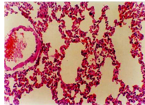
Fig. 2: LPS + resveratrol group: less edema, hemorrhage and infiltration of inflammatory cells into lung tissues (10x20)

Levels of TNF-α and IL-6 in serum: The serum levels of TNF-α in LPS alone group and LPS + resveratrol group were significantly higher than those in saline group (p<0.01). Compared with the LPS alone group, the serum levels of TNF-α were significantly decreased in the LPS + resveratrol group (p<0.05) (Table 3).