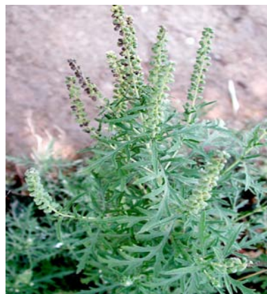
Fig. 1: Ambrosia maritima L. damsissa

In Sudan, dry A. maritima shoots are used in traditional medicine for the treatment of gastrointestinal disturbances and used as antidiabetic (El-Ghazali, 1986). A. maritima shoot is used in some African countries as a molluscicide (El-Sawy et al. , 1989;