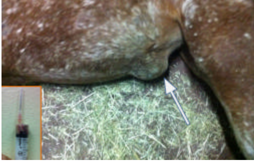
Fig 1: Ventral subcutaneous abscess and macroscopic aspect of the content (window)

dryness of mucous membranes were present. The horse was hypothermic (35.7°C), mucous membranes were slightly pale and toxic, the heart rate was 58 beats/min whereas the respiratory rate was 28 breaths/min. Arterial pulse checked at maxillary artery was accelerated and weak. Because of this critical status the mare was hospitalized.