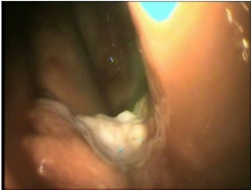
Fig. 5: Purulent material in the left guttural pouches

abscesses and urine sample were cultured on Tryptone Soya Broth (Oxoid, Milan, Italy) for 6 h under aerobic and anaerobic conditions and then subcultured on Columbia blood Agar with and without Streptococcus Selective Supplement, MacConkey Agar, Mannitol Salt Agar (Oxoid, Milan, Italy) for 24-48 h at 37°C under aerobic and anaerobic conditions. Biochemical characterization was achieved using the commercial Rapid ID32 Strep (RapID™ System, Oxoid, Milan, Italy) and API 20 Strep Systems (bioMerieux, Italy) according to the manufacturers instructions.