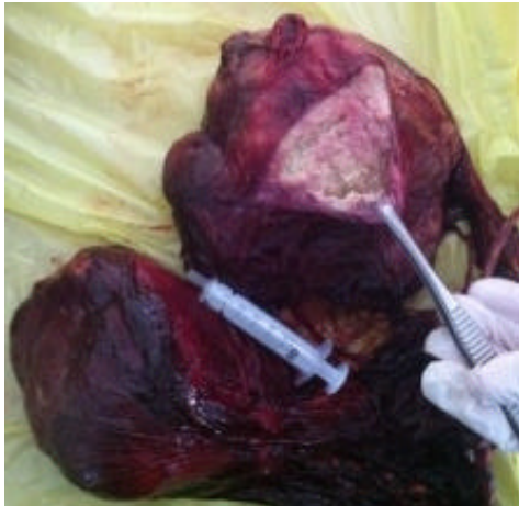
Fig. 3: Mesenteric abscesses

and morphine sulfate ( 0.3 \text{ mg kg}^{-1} \text{ IM} ). After few hours the mare has been euthanatized on owner request.