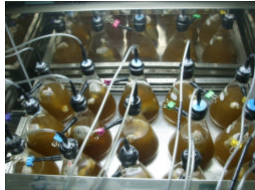
Fig. 2: Buffer, rumen liquor and feed sample containing reactors in the incubator

experimental feed ingredients are shown in Table 1. Clean dry-nylon bags (mesh size: 30-50 μm; dimension: 5×10 cm) were rinsed in acetone for 3-4 min and completely air dried before sampling. After measuring the weight of nylon bag, 1.6 g basal feed (as correction factor) and 2.4 g ground experimental feeds were put into each bag. Basal feed was composed of 0.8 g ground rice straw and 0.8 g formula feed in every case. Nylon bags were sealed properly after adding 4 beads in each bag to ensure the complete immersion in the buffer solution. Prepared nylon bags with feed samples were placed in the marked fermentation reactor to make ready for the fermentation. When the fermentation reactors were warm up about 37°C, 80 mL diluted rumen inoculums were added in each reactor. Rumen fluid and contents were collected from non lactating fistulated Korean cattle (maintained at National Institute of Animal Science on a standard diet concentrate:roughage = 40:60) at approximately 30 min after feeding and put it into a pre-warmed insulated container. Then, anaerobic condition was maintained by injecting CO 2 gas and homogenized the liquor by blending at high speed for 30 sec. Homogenization needs to dislodge the microbes that were attached to the fibrous mat and assured an adequate microbial population for in vitro analysis. Homogenized digesta (liquor) was filtered through four layered cheesecloth continually