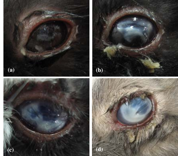
Fig. 2: Rabbit eyes; a) 24; b) 48; c) 72 and d) 96 h after topical challenge with P. aeruginosa (immunized group)