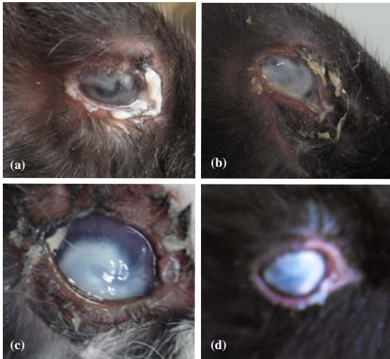
Fig. 1: Rabbit eyes; a) 24; b) 48; c) 72 and d) 96 h after topical challenge with P. aeruginosa (non-immunized group)