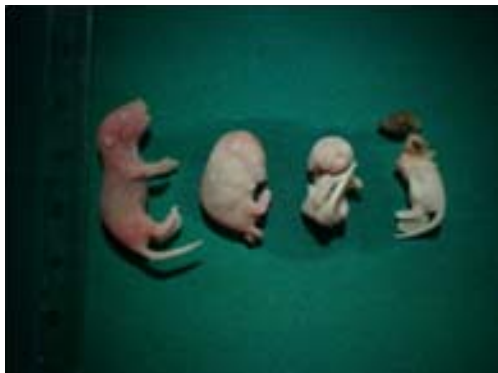
Fig. 4: A malformed infant from experimental group