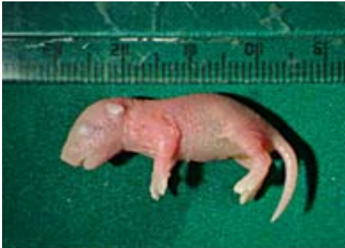
Fig. 3: Aborted infants forms a female mouse in experimental group