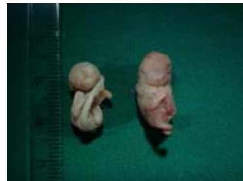
Fig. 7: A live infant from control group

high concentrations to produce myocyte damage in vitro . Tests with anthracycline analogues also demonstrated the ability of the assay to rank-order cardiotoxic agents on a weight basis: idarubicin greater than DOX greater than daunomycin greater than aclarubicin. When the in vitro drug concentrations required to lower ATP/protein ratios to 50% of controls were related to clinically achievable