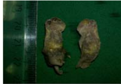
Fig. 6: A head-mal formed infant from experimental group