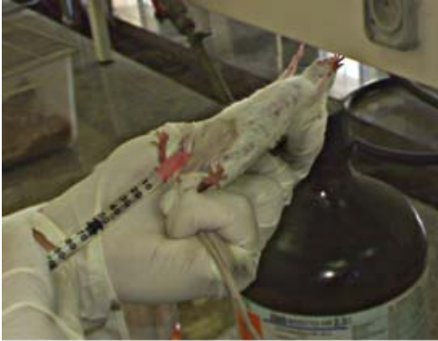
Fig. 1: The injection of the drug to pregnant mice