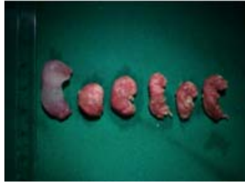
Fig. 5: Tale-malformed infants from experimental group