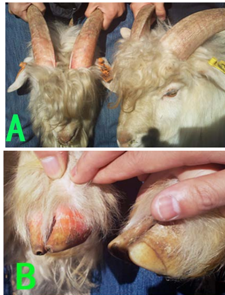
Fig. 3: Transgenic goat expression of red fluorescent protein: Expression of red fluorescent protein in cashmere goat horns A) and goat hooves; B) (in each case: left, transgenic cashmere goat; right, control)

morphology for embryo transplantation investigations. A total of 368 recipient goats were transplanted and 48 goats were born with 35 survivors remaining after 1 week (Table 1). Sexes of all kids matched the SRY-PCR results. Furthermore, PCR analysis of genomic DNA extracted from transgenic cloned kids showed that exogenous genes (neomycin resistance gene) were integrated into the cashmere goat genome. Ear apex tissues of transgenic cashmere goats were cultured in vitro and examined microscopically for the expression of exogenous red fluorescent proteins. Partial transgenic goats highly expressed (Fig. 2a and b) and partial transgenic goats presented exogenous red fluorescent protein expression in appearance to a certain extent (Jang et al. , 2010) (Fig. 3a and b).