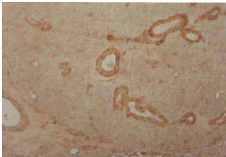
Fig. 1: Immunopositive basal cells 25X