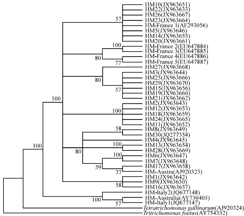
Fig. 2: Phylogenetic tree of Histomonas meleagridis (HM) based on the 18S rRNA gene sequences. HM1-HM30 are the sequences from East China. The GenBank accession numbers are given in parentheses

1: JQ277354; 2: JX963642; 3: JX963643; 4: JX963644; 5: JX963645; 6: JX963646; 7: JX963647; 8: JX963648; 9: JX963649; 10: JX963650; 11: JX963651; 12: AF293058; 13: EU647884; 14: EU647885; 15: EU647886; 16: EU647887; 17: AJ920323; 18: AJ920324; 19: AY754332