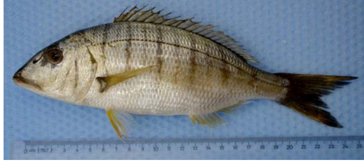
Fig. 2: Illustration of Lithognathus mormyrus (Satlnis, 2014)