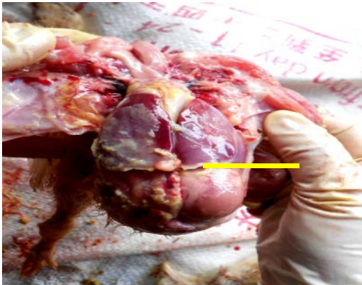
Fig. 3: Fibrinous coating on the surface of the liver