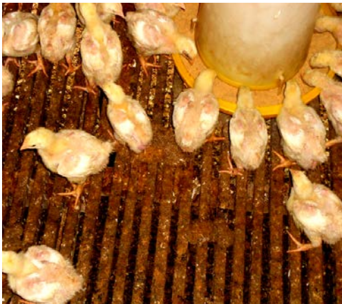
Fig. 1: A few inappetent chicks

Antibiotic sensitivity test for E. coli : The result of the antimicrobial sensitivity test showed a remarkable susceptibility to gentamycin an intermediate susceptibility to tetracycline and resistance to amoxicillin, streptomycin, clindamycin and trimethoprim (Table 2).