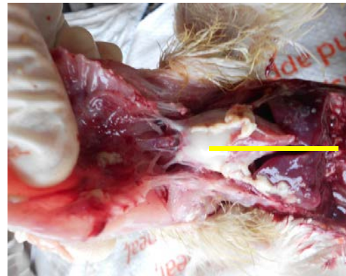
Fig. 5: Deposition of fibrin on the pericardial sac