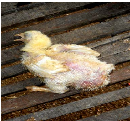
Fig. 2: A sick chick with open mouthed breathing