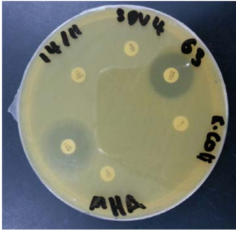
Fig. 7: Antimicrobial sensitivity test for E. coli on MHA agar