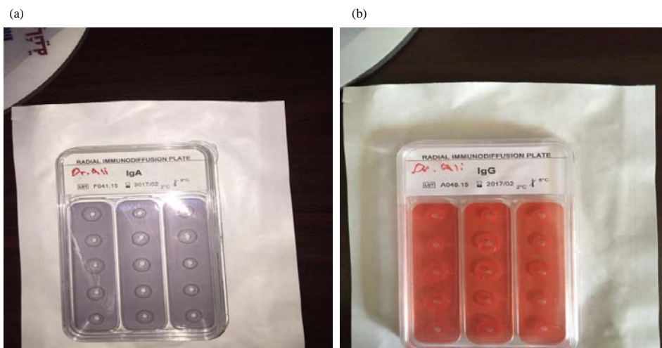
Fig. 1: a) The reaction of serum specific antibody (IgG) for groups under study then to determine the concentration of (IgG) and b) The reaction of serum specific antibody (IgA) for groups under study then to determine the concentration of (IgA)

specimens were collected from patients of Al-Imamayn Al-Kadhomyayn Medical City, Um Al-Baneen Fertility and IVF Center.