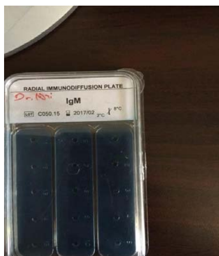
Fig. 2: The reaction of serum specific antibody (IgM) for groups under study then to determine the concentration of (IgM)

Clinical tests were applied on all women according to Radesic and Tremellen (2011) as follows: The blood was collected then sera were examined for all investigations at cycle day 2, 7 and 10 to determine hormones levels within 1 h. like LH, FSH, prolactin and Estradiol (E2) by using ELISA technique and according to each hormone quantify