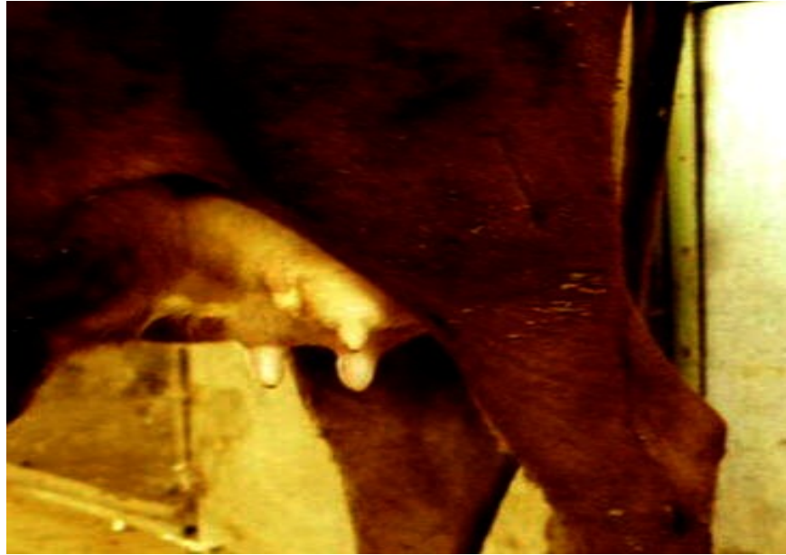
Fig. 3: A kenana-friesian crossbred cow with severe mastitis experimentally induced by Nocardia farcinica strains. Note the swelling and the asymmetry of the infected three quarters (No. 2-4) in comparison to the control quarter No.1

took place. There were only slightly visible altered milk secretions and the milk color and consistency went towards normal quickly. Milk from infected quarters reacted moderately to RMT with increased values of somatic cell counts. The size and consistency of the udder tissue was almost normal.