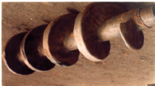
Fig. 1: Worn-out screw

Severe metal wear is identified as the major problem facing oil palm mills in the developing countries. A study carried out at Rison Palm oil mill, Ubima in Rivers State in Nigeria revealed that the press screw unit constitute the heart of severe wear and breakdown in the industry. Unfortunately, the cost of importing the screws is too high for the local oil palm mills. The high running cost occasioned by this problem has forced the mills to operate at far below their installed capacities. The present practice of electrode-filling of the worn out screws has not helped issues, as the screws rapidly wear out in the next few