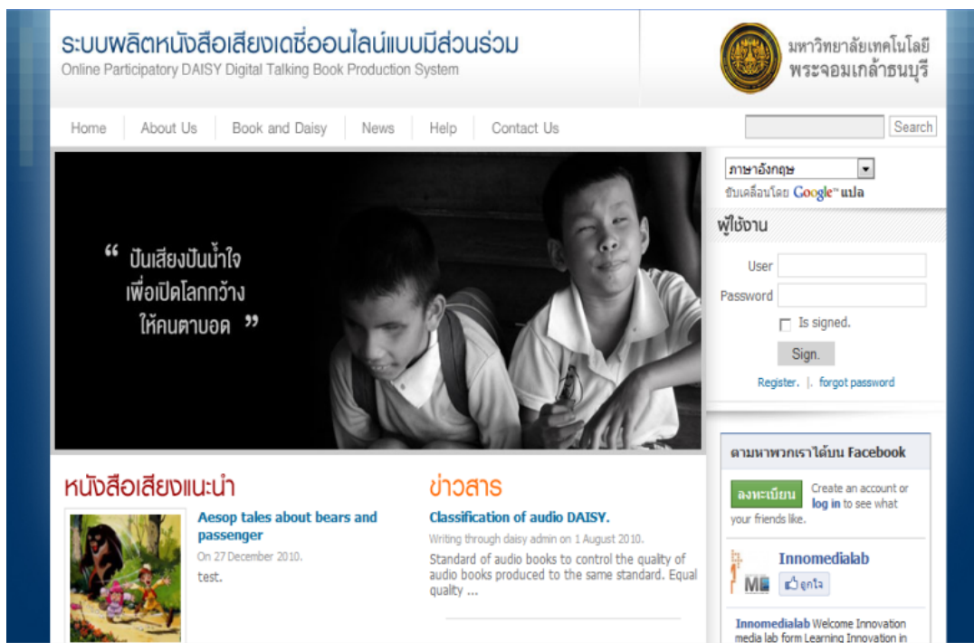
Fig. 2: Main webpages of OPDAISYS

additional increase content file in text and jpg format by themselves and this can be support the work of webmasters.