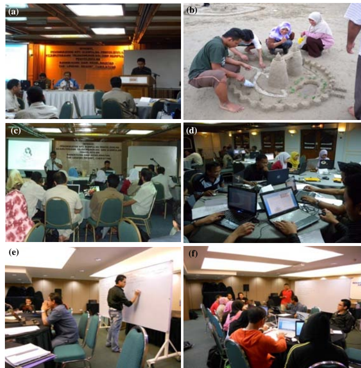
Fig. 1: Some of the activities can be organized in the publications stimulator workshop: a) the opening session; b) games; c) talk; d) writing session and improvement of the journal; d) meetings of research direction and e) presentation by the student

Figure 1 is an photography example of publications stimulator workshops were held by one of the research group in one of the local university.