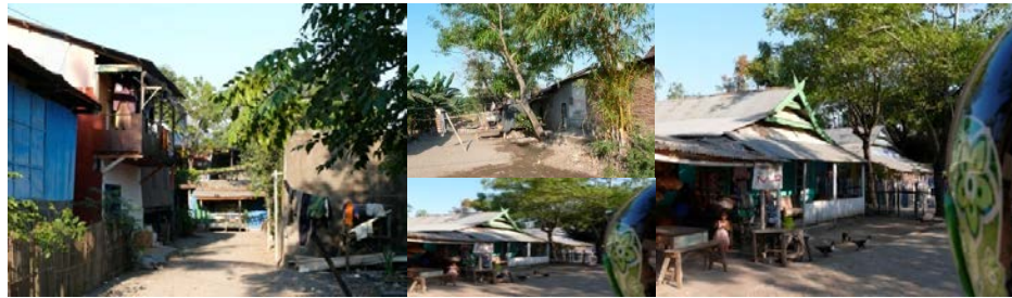
Fig. 2: Slum area environment at the urban fringe of Makassar City

always direct and control their employees and production. Relation between the master and his servant which will associate with class division and frictions is stimulus for formation of co-existence of mode of production which will occur.