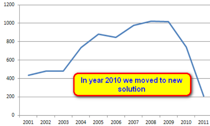
Fig. 1: Legacy transformation phases