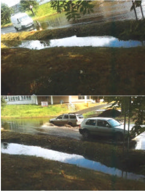
Fig. 1: Photo documentation-the photos showing the emergency state, common danger state at the Kaufland shopping centre caused by insufficient of the Local Road Space Catch Drain (LRSCD) at Jirasek and insufficient function of the follow-up concentration and transfer object of the (LRSCD) and the relief sewer

The “Assessment of subsidence effects to surface at the site of SC Kaufland in the cadastral territory of Horni Litvinov” of 12/2011 which was available; it was confirmed that the area of interest is found in the coal basin with production development of coal bed which is tectonically impaired in abundance. The SC Kaufland zone is undoubtedly undermined (by room and pillar mining in its larger eastern part and by drifts and blind shafts in its smaller western part). Collapse processes at ground level induced the development of a synclinal valley (drainless ground depressions) of a larger surface area. In terms of hydrogeology, it is solely a synclinal valley (consisting of man-made ground and tertiary clays) in the area of interest which is saturated from the Divoki potok stream flood plain and also with subsurface water from the quarternary group of strata. The datum on the occurrence of underground water at a depth of approx. 4.5 m under ground level can be considered as important information. A shallow subsurface groundwater body developed in the quarternary filling corresponding to the development of free water surface in the nearby Divoki potok stream. In terms of filtration parameters of superjacent clays, it can be stated that the value of the filtration coefficient k_f