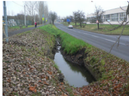
Fig. 3: Photo documentation - general view of the LRSCD in the direction of the roundabout at the connection of Jirasek-Lomska-S.K. Neumann streets; the catch-drain is not maintained. With proper function of the pipe underpass, the water should be transferred to the opposite side of the local road and further through the concrete DN 200 relief sewer into the Divoky potok stream; however, this important concentration and transfer object is in a poor state; the inlet to the pipe underpass and to the following relief sewer is not secured against inlet of sediments which in connection with absence of operational maintenance had a harmful influence on the permeability of the pipe underpass and to subsequent relief sewers

including the adjoining local road, actually and involuntarily takes and simultaneously fails to fulfil duly and it cannot fulfil the function of a pseudoretention tank. The extent of the gathering ground from the lands allotted by the boundary of areas of partial drainage areas of lands 1 and 2 (Fig. 2) is then bound to various situations of rainfall that is manifested here as extreme one. The emergency situation at the SC Kaufland at Jirasek street was actually raised by the circumstance that the ground surface in proximity over the LRSCD shows a considerable break which induces a risk of outflows of phreatic water, a risk of subsequent enlargement of the volume of water flowing in. Photos in Fig. 1 show the emergency state, virtually the state of common danger at the SC Kaufland caused by poor function of the LRSCD at Jirasek street and by unsatisfactory function of the following CTO and by malfunction of the relief sewer in consequence. It is also likely that a certain portion of waste water or water containing oil products gets into the LRSCD, e.g., as a consequence of leaking sewers as well as a result of mistakes or a result of irresponsible