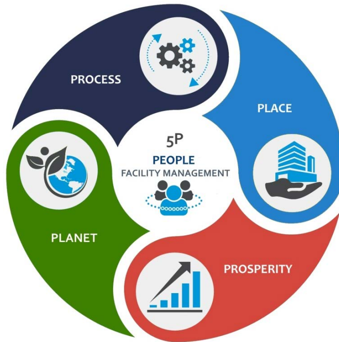
Fig. 1: “5P” facility management definition

of information for their further utilization or analysis and their disunion does not allow mutual cooperation and comparison. It is exactly these insufficiencies that are enabled to be resolved by facility management tools.