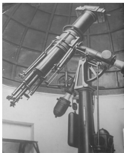
Fig. 2: The Heliometer (1910)

An observation on the Heliometer of Repsold: For further Heliometric observations in Engelhardt Observatory, a constant observer was required, as from 1905 there was no observer for the Heliometer. The graduate of Warsaw University was invited to take this position a professorial grant-aided student. After his magister's examination, from July 1910 he started to work as an assistant at Engelhardt Observatory. The Heliometer in Fig. 2 was transferred to him for the continuation of works on studying physical liberation. A skillful observer, in executed from 1910, 1915, 133 fine observations on accuracy (994 measurements concerning points of the