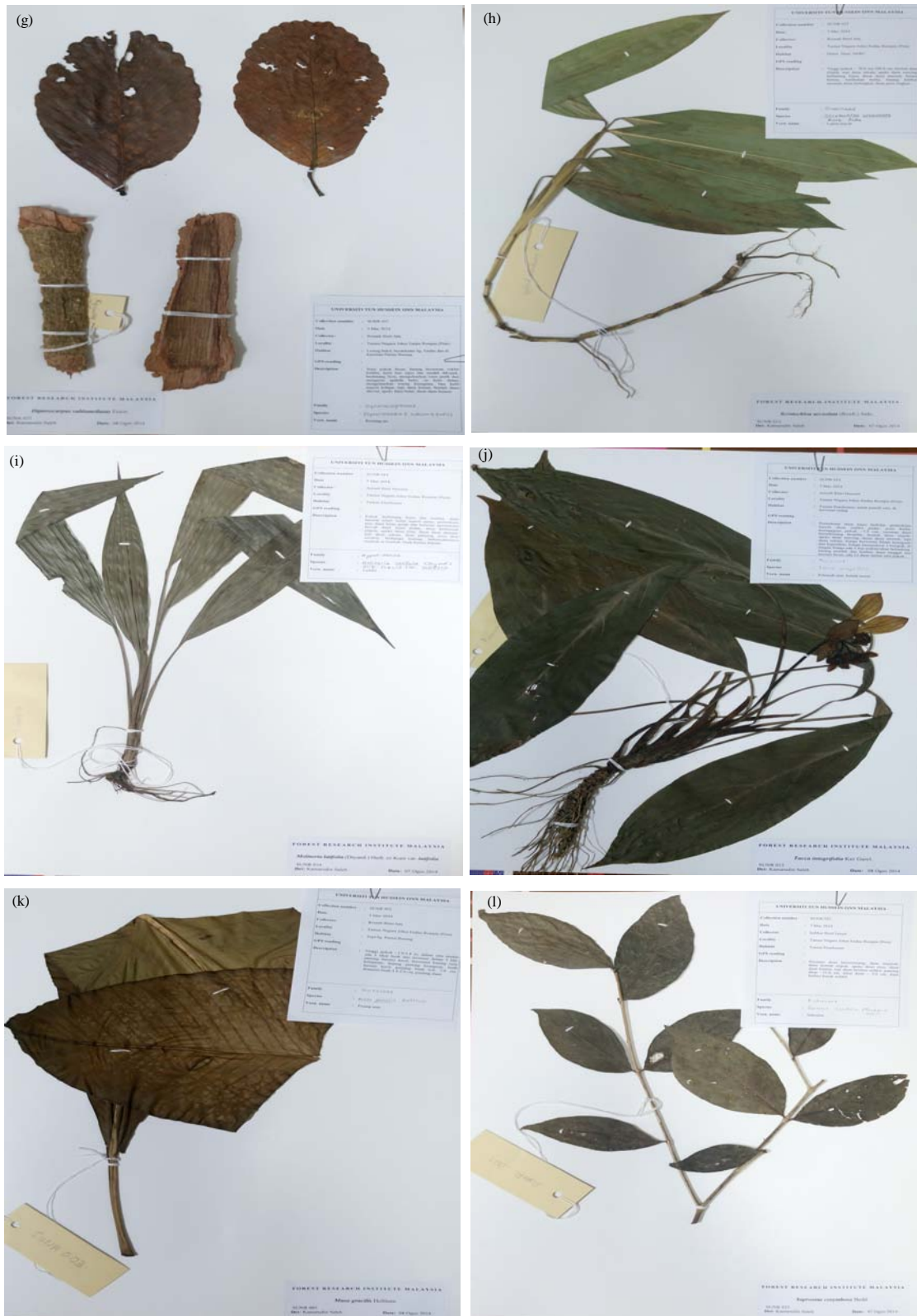
Fig. 1: Continue