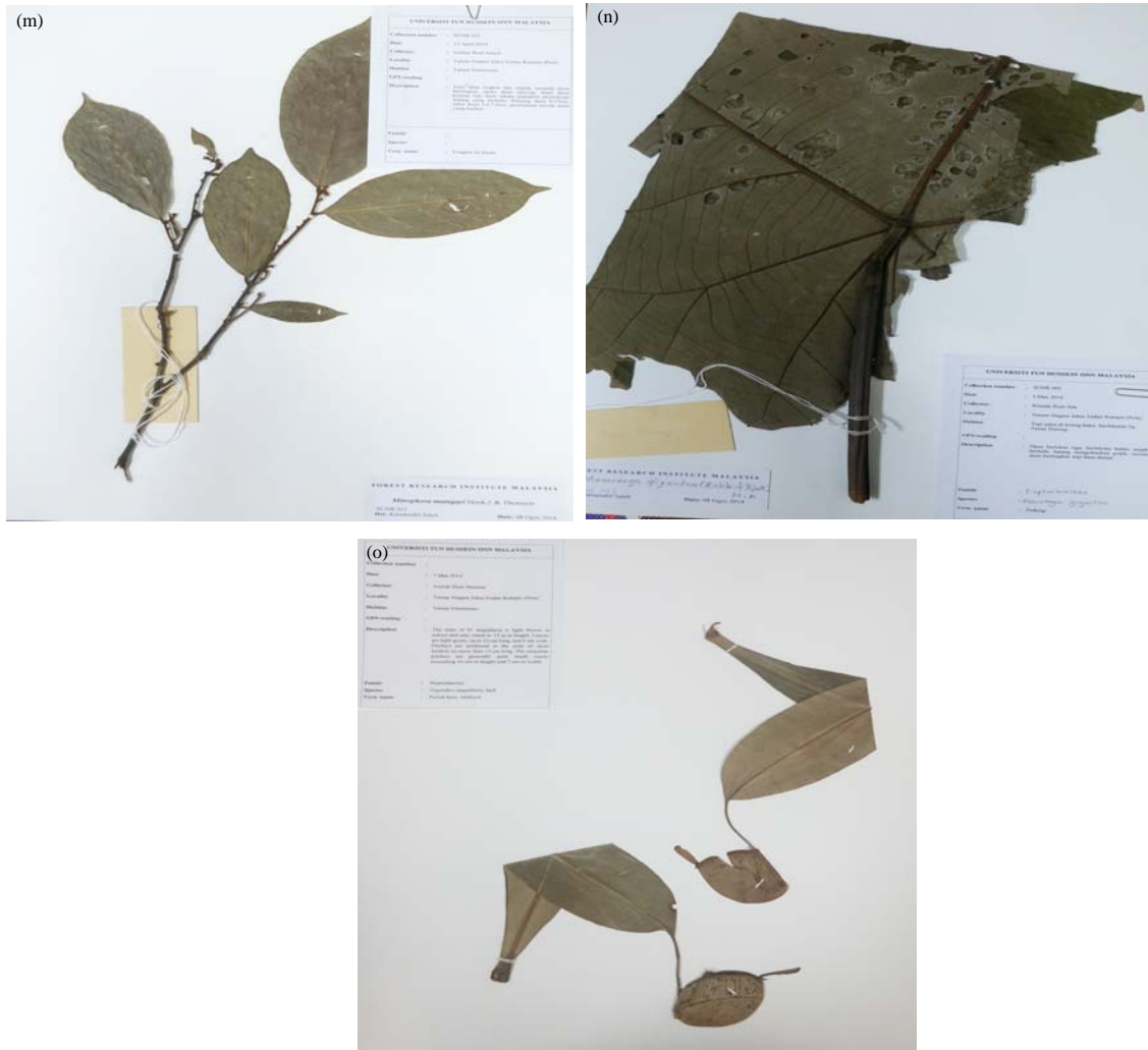
Fig. 1: Some of the voucher specimens for medicinal plants used by Jakun people in Endau-Rompin (PETA): a) Microcarpus xanthopus ; b) Labisia pumila Benth; c) Eurycoma longifolia Jack; d) Compnosperma auriculatum ; e) Tetracera macrophylla ; f) Scaphium macropodum (Miq.) Beumee ex. Heyne; g) Dipterocarpus sublamellatus Foxw; h) Leptaspis urceolata (Roxb.) R. Br; I) Molineria latifolia (Dryand.) Herb ex. Kurz var. latifolia ; j) Tacca integrifolia ; k) Musa gracilis Holtttum; l) Saprosma carymbrosa ; m) Polyathia bullata king; n) Macaranga gigantean (Rheb and Zoll) M.A; o) Nepenthes ampullaria Jack

biodiversity conservation threats such as unsustainable overexploitation, habitat modification and deforestation. It is interesting to note that Jakun's ethnomedical knowledge reflected their thoughtful conservation efforts and respects towards nature. Even it is a small community, there are variations in the traditional practices of medicinal plants as used by the Jakun people.