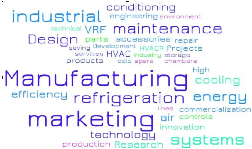
Fig. 2: Visualization for global context. Results of the analysis powered by ( http://worditout.com/ )

related to the manufacture and commercialization of air conditioning, refrigeration, ventilation and heating systems as well as design, installation, assembly, maintenance repair and manufacturing which represent a greater relevance in the analysis developed. The main market for these services is the commercial sector (shopping malls, warehouses, shops, etc.), followed by systems for industrial installations. Some companies also emphasize the realization of research and development activities, especially the big producers of equipment to reinforce their business models as United Technologies Corporation (UTC), Carrier Corp., Bryant, Totaline, Payne, York, Metasys, Thermo-King, Trane, Daikin, Lennox-International, Inc., Mitsubishi Electric, Mitsubishi Heavy VRF, Fujitsu, Hitachi, Sanyo/Panasonic and Toshiba, LG Electronics, Samsung, Gree, Midea and Haier among others.