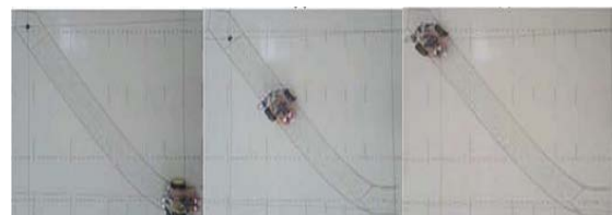
Fig. 2: Simulation 3-FCM1 embedded in a real mobile robot

these values are normalized into the interval [0, 1]. It also shows the concepts and relationships for avoiding obstacles. In resume, weights W14 and W35 are positives otherwise, the weights W34 and W15 are negatives. The sign and value of the causal relations depend on the intensity and influences between the particular concepts. These values are necessities for avoidance maneuvers. The W24 and W25 weights connected to frontal sensors and wheels have negative values when the obstacle is near the robot decelerates. These weights are tuned using Hebb learning, similar to FCM1.