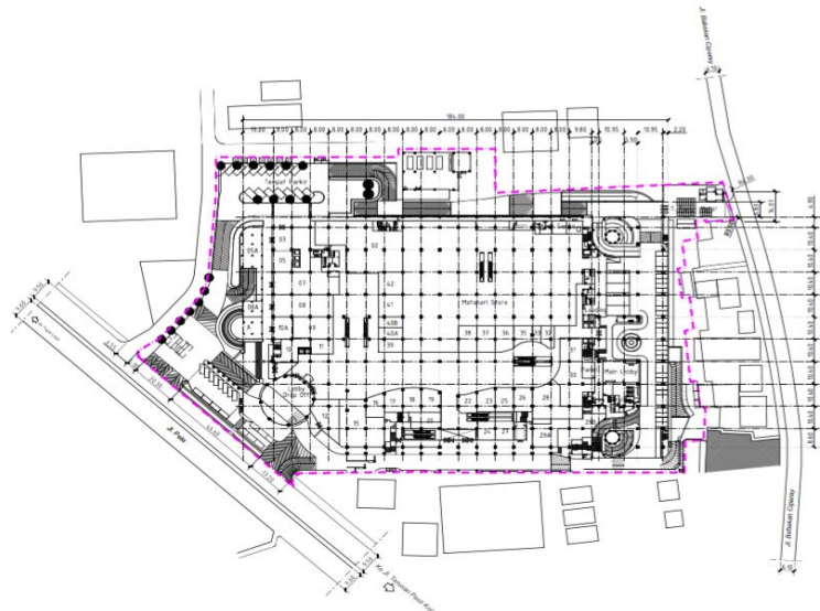
Fig. 1: Site plan of festival city link (mall)

Hotel 10.324 m 2 (70 lots) spacious parking: POP Hotel (Budget Hotel) 4,209 m 2 (35 lots). Spacious parking: Mall 50.162 m 2 (1250 cars, 1000 motorcycles).