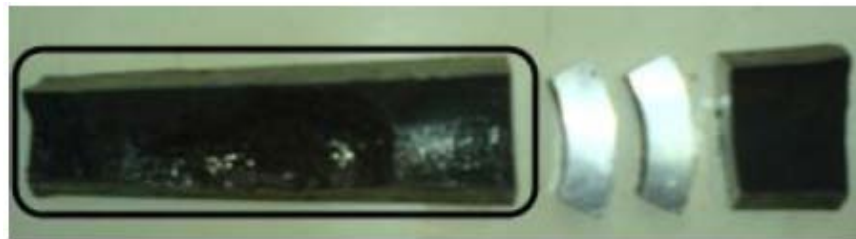
Fig. 2: The part with the location of interest (first from the left)

utilization of customary mechanical testing and option ways to deal with focus the mechanical properties are needed. Micron and sub-micron space hardness tests display a reasonable different option for customary testing. miniaturized scale and nano hardness testing give a littler length scale in respect to full scale hardness testing, for the hardnes's assessment for the estimation of other mechanical properties, hence, taking into account the testing of even the littlest parts. The motivation behind performing the hardness test is to check for any variety of hardness in the T-joint. Likewise, the information delivered from the test can be utilized to confirm heat treatment. The hardware used to perform the hardness test is a robotized mechanical assembly to make Rockwell and Brinell hardness estimations. The Rockwell hardness scale utilized was scale B with a 1/16 inch distance across ball indenter.