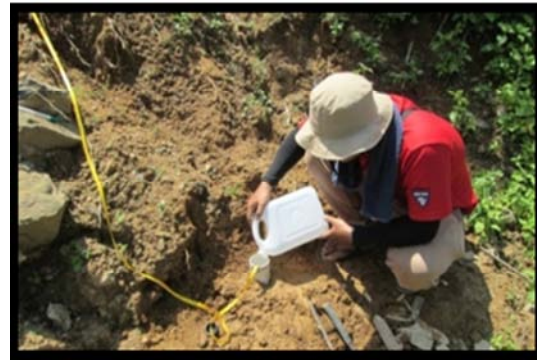
Fig. 3: The sample image for infiltration data, take in Pakem

The physical properties of lithology in the recharge area were observed based on the ability of infiltration and permeability of rocks in the Ngaglik and Pakem sub-districts (Mu et al. , 2015) infiltration process is the event of water infill to the ground through the surface of the ground as vertically. Furthermore, the amount of water that fills through the surface each time is known as an infiltration. The value infiltration rate is highly dependent on the capacity of infiltration, the soil's ability to pass water from the surface vertically. According to Purwanto et al. (2015), Vavro and Soucek (2013) the value of infiltrations in the region are as in Table 1; Fig. 3 and 4 which was shown similar to the rate of infiltration quite large around 20 mm/h.