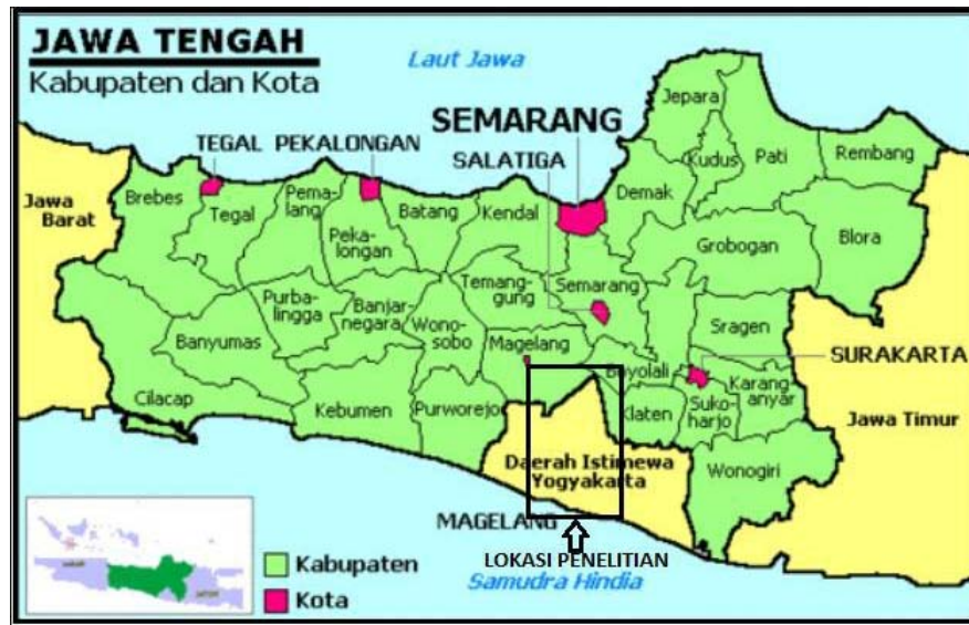
Fig. 1: The research location map

The field observation: At this observation stage was conducted the general observation related to the conditions on the field either in the form of physical condition or water conditions. The general observations can be generated into specific things: