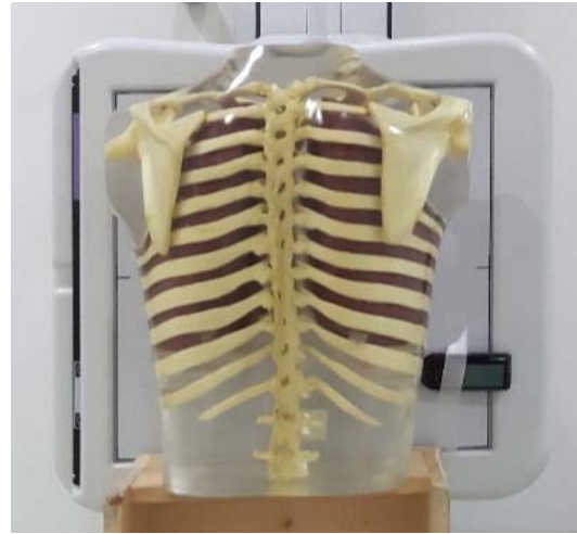
Fig. 1: Chest phantom

Image analysis: DICOM files transmitted by Picture Archiving and Communication System (PACS) were analyzed by image J (Version 1.49) which is a program for value and image analyses developed by National Institutes of Health (NIH). The ROI was set from each DICOM image by image J and its SI was measured after establishing 5 points including L (Lung field), LM (Lung