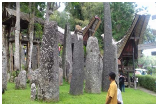
Fig. 5: Rante is one of the built environment Tongkonan with Simbuang batu (stone) and Lakkean as a place to lay the corpse during the funeral ceremony and Bala kayan as a place to divide the meat

Liang: The last built environment is Liang (grave) which is a place to store corpses or to keep corpses that have been preserved. At the funeral ceremony (Rambu Soloq), after a person has died, especially if he is a noble his corpse is preserved with spices and kept in Tongkonan's house for some time, even several years and then a ceremony is conducted at Tongkonan's house. During the ceremony, the front yard (Luba'ba) becomes a very important place as the area of ceremonial execution, especially the reception procession. Then towards the cutting of a buffalo called Ma'tinggoro tedong, the corpse is taken to Rante and placed on the Lakkean for several days. On the day of the buffalo slaughter in Rante, usually before the killing, the buffaloes are first pitted against each other and the ceremony is usually very crowded. Many people watch and some even bet which buffalo will win the buffalo fight. There are dozens of buffaloes for slaughter, up to 100 or more rich and influential people.