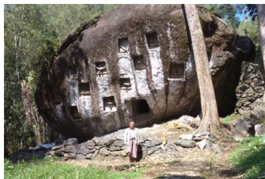
Fig. 6: Liang Paa' Grave stone carving is one Tongkonan built environment

After cutting the buffalo, the next day is usually followed by a funeral procession which is to bring the corpse to be stored in Liang Paa (stone grave). As the last built environment, every Tongkonan has its own chisel stone as the family grave, so that, 1 piece of stone carving, usually keeps up to dozens of corpses. According to him, although, the door of the stone grave looks small inside it is wide enough to accommodate scores of corpses. What else is the duration of the process of storing corpses is usually, so, long that the previously stored corpse is usually destroyed before the newly inserted corpse (Fig. 5 and 6).