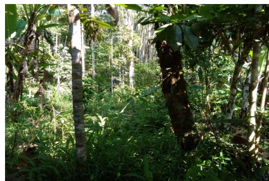
Fig. 3: Protected forest (Kombong)

economy, one Tongkonan, i.e., Tongkonan Potoksia is given the special task of regulating the field of agriculture.