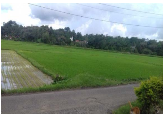
Fig. 4: Rice field (Uma) is one of Tongkonan built environment

Rante: Another built environment is Rante, a place for conducting funeral ceremonies (Rambu Soloq). In the Tongkonan Bori neighborhood there is a large Rante, equipped with stone pillars (Simbuang) to which are tied the buffaloes that will be killed during a funeral ceremony. In addition, there is also Lakkean which is a high stage covered with a roof which is where corpses are laid during the ceremony. In Rante Kalimbuang Bori 'there are 8 Lakkean which is a pair of each Tongkonan who perform custom function in Kalimbuang Bori area'. In addition, in the middle of the Rante there is a high stage which is also topped but its shape does not resemble a traditional Toraja house called Bala'kayan. It's a place to share meat. So, the buffalo meat that was slaughtered is carried up to the Bala'kayan; then the traditional ruler who served to divide the meat shouted from above the name of every person or group entitled to get meat at the ceremony (Fig. 4).