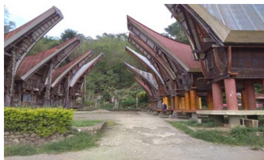
Fig. 2: Line of rice granary (Alang) in front of Tongkonan and Luba'ba or space between Tongkonan with Alang