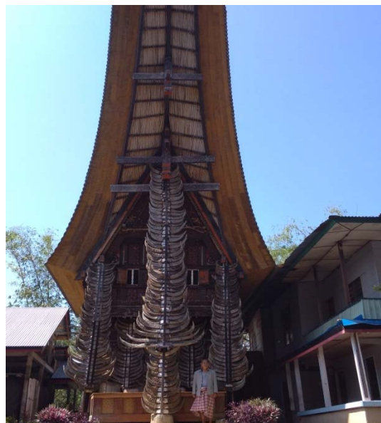
Fig. 1: Tongkonan Lumika'

Uma: Rice field (Uma) is also a built environment Tongkonan whose function is very large as a source of family economy. The main food of the Toraja people is rice so, the cultivation of rice crop is very important, so that the life of the society supporting the culture becomes prosperous. Given the importance of this agricultural