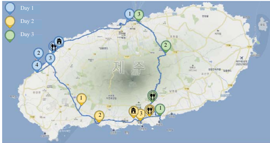
Fig. 3: The 2 nights and 3 days recommended travel product for 20 or 30 sec during the summer vacation season in Jeju

creditcard usage is the highest at the beach. We chose the Hyeopjae guest house in the lodgment dense area within a 1 km of the beach so that tourists can easily change accommodation in the process of making my travel product. In day 2, we choose Jungmun Saekdal Beach, Camellia Hill and Lee Jung Seop Street as shown in yellow in Fig. 3. Although, the food portion in Jungmun Saekdal Beach was high as shown in Table 1, we chose the Yong's restaurant and the Jenny's home guest house near Lee Jung Seop Street considering the travel route at the day 2. In day 3, we choose Soesokkak, Jeju Jeolmul Natural Forest Resort and Yongduamas shown in green in Fig. 3. In day 3, we chose the Aseowon restaurant located near Soesokkak considering the route and lunch time. In day 2 and 3, tourists may stay at Jungmun tourism complex and can select tourist destinations such as Cheonjeyeon Falls and Yeomiji botanical garden, restaurants and accommodations while creating my travel products.