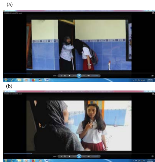
Fig. 2: a, b) The attitude of a decent child and respect for parents

guidance good behavior for the primary school students, next day the children go to school by good behavior to the parents, thrift, like saving a money, discipline, keep clean the school and show the other students that naughty, lazy, lavish, like buying snack do not care about cleanliness and the effect is when the examination day they cannot do the test. Another activities are there are association of the parents in the village, one of the parents that show the thrift not arrogant and there are