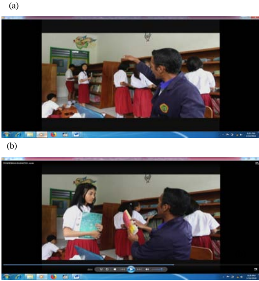
Fig. 7: a, b) Student's attitudes studied in the library diligently

getting achievement. Teacher's primary school played the character education movie. Second meeting, teacher's primary school explained the objective of the learning. It was finding out the creativity in seeking good behavior for primary school students. Teacher's primary school gave opportunity to the each students group to present some positive behavior for students and gave the command about actor behavior from the movie that had watched.