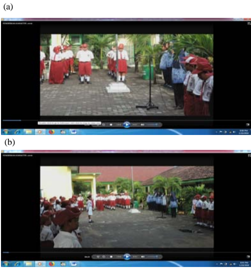
Fig. 3: a, b) Disciplined student's attitudes following the flag ceremony every monday