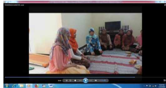
Fig. 8: Dialog between simple living parents

getting achievement. Teacher's primary school played the character education movie. Second meeting, teacher's primary school explained the objective of the learning. It was finding out the creativity in seeking good behavior for primary school students. Teacher's primary school gave opportunity to the each students group to present some positive behavior for students and gave the command about actor behavior from the movie that had watched.