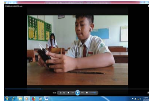
Fig. 6: a, b) Lazy child behavior

parents that has character that show off their wealth, arrogant and actually they have problems to another person.