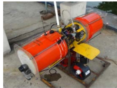
Fig. 3: Surface water autonomous navigator

The underwater acoustic images are often of low contrast and hence need to be enhanced in order to make the image suitable for effective segmentation. The Contrast Limited Adaptive Histogram Equalisation (CLAHE) has been exercised upon the filtered sonar images for segmentation process. Figure 3 shows the surface water autonomous navigator.