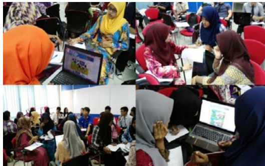
Fig. 1: Participatory design session with end users

In the session, the students were instructed to develop their own digital educational comic related to web programming topics (Fig. 1). After their completed LGC were submitted, a formal discussion was conducted to reflect their experiences in LGC production. The students were required to critically reflect the process that effectively assisted them to produce decent LGC by responding to reflection topics. Examples of student's responses from reflection session.