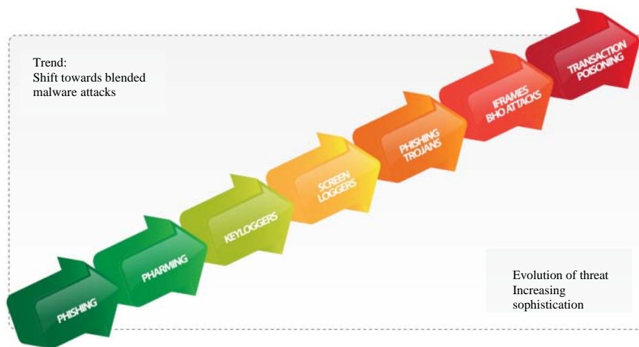
Fig. 1: Evolution of threat (Easy Solution Inc., 2015)

From Gartner in his report (April 2, 2009), "The War on Phishing is Far From Over", states that 5 million consumer of the United State of America population