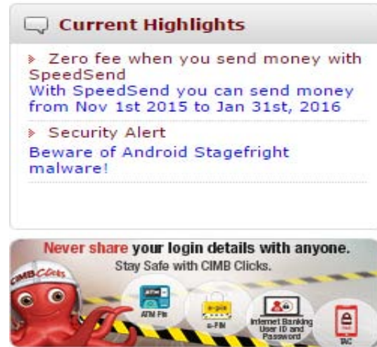
Fig. 2: Security information guidance (CimbClicks, 2015)

Biometric: Any automatically measurable, robust and distinctive physical characteristic that can be used to verify or validate the identity of an individual is referred as biometrics. Since, each people has unique physical properties which are based on their heredity, biometric characteristic are difficult to be tampered (Liou and Bhashyam, 2010; Thigpen, 2015). For many biometric identifiers, the actual biometric information is rendered into string or mathematic information. Using special provided hardware, users may authenticate via fingerprint, voiceprint, hand geometry and even iris scan. After the