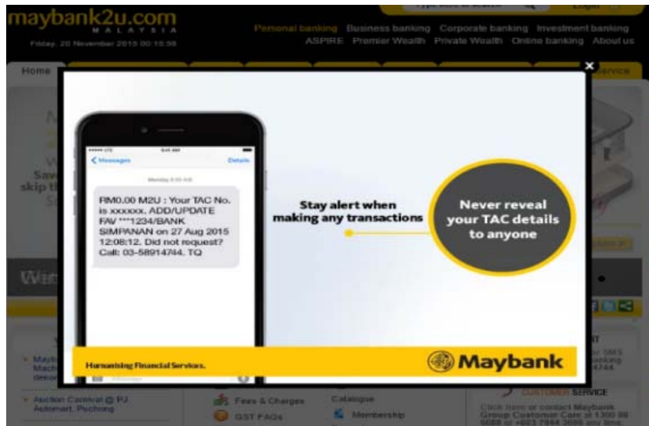
Fig. 3: Pop up advertisement (Maybank2u, 2015)