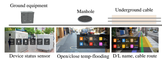
Fig. 3: Application examples of power facility management system utilizing ARP

Main features of system: This system provides the status of underground power facilities as a form of AR information through the smart device. It visually displays the status of the underground power facility and the route of the underground power cable. The GPS information and 3D visualization technologies are used to implement the power cable information map. Additional information is provided when the corresponding area or equipment is selected through the map service. In other words, a synthesized image of a virtual image such as the drawing or the specification are displayed on a real object when a specific power facility is selected through a real smart device. The main functions of this system include user authentication, facility recognition according to location (direction) facility detail inquiry, map view and sensor